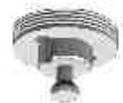
AMT-17172 Disc retention bolt