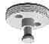
AMT-17174 Disc retention bolt, off-grid

Black oxide finish on retention connectors.